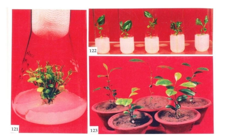
Figs. 121-123: Cultures of Citrus jambhiri

Figs. 119-120: Nurturing and hardening of nucellar embryos before transplantation to potted soil