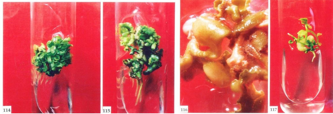
Figs. 114-117: Cultures of Citrus jambhiri

Figs. 114-115: Almost embryo-to-embryo proliferation, embryos at cotyledonary stage are seen