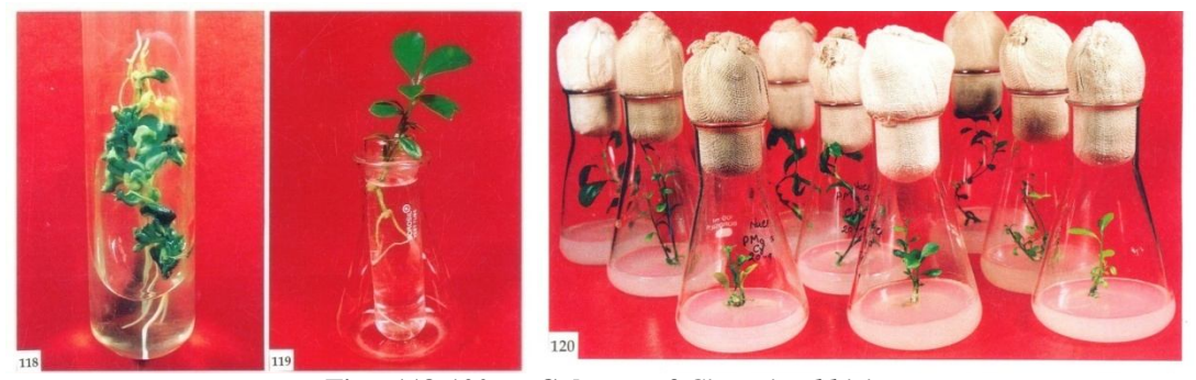
Figs. 118-120: Cultures of Citrus jambhiri

Fig. 117: Germination of nucellar embryos